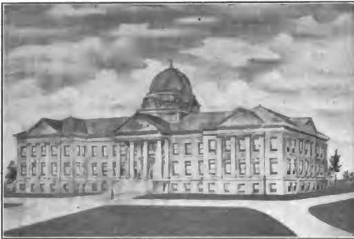
SOUTHWESTERN COLLEGE, WINFIELD.